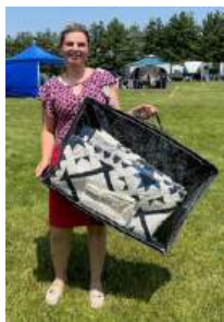
Our lucky 2023 winner!

A surprise prize will also be awarded to the runner-up!