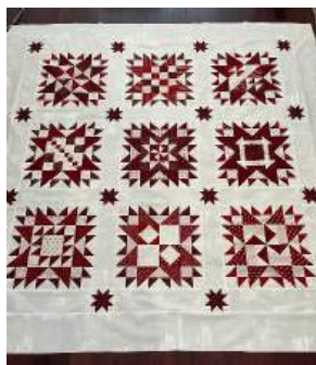
Finished quilt will be Queen size

To celebrate CFSO's 35 th anniversary regional specialty shows, a brand new Queen size quilt with 2 matching pillowcases. A winner will be drawn at Monarch Kennel Club's 2025 show in Dorchester, Ontario