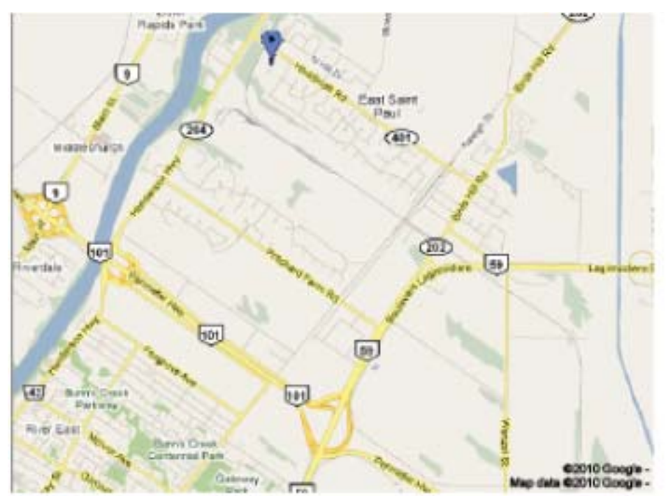
Directions to Show Site

From south: Take Highway 101 north to Henderson Hwy. Travel north approx 2 miles to Hoddinott Road, turn right (east) onto Hoddinott Road, go 1/4 mile - East St Paul Arena is located on the south side of the road.