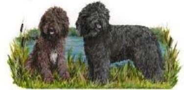
Club Barbet Canada - 2024 National Specialty

CONFORMATION - Regular & Non-Regular Classes