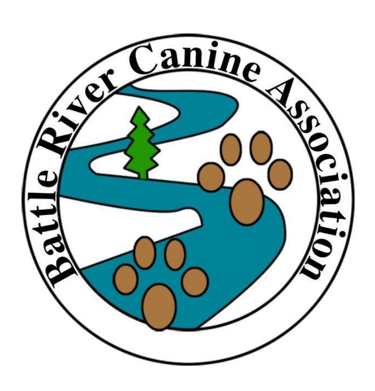
The BRCA is offering an ARMBAND draw of $50 for Conformation and Obedience/Rally EACH DAY. Watch for numbers at the Show Secretary tables.

* Dogs entered in Sweeps must also be entered in an official class (CKC 12.8.1)