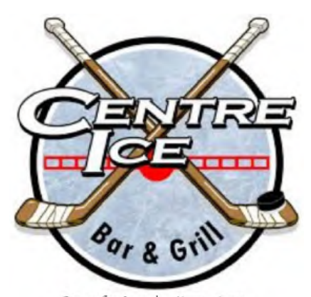
Open for Lunch - Ham - Ipm

Please contact us at SSMKCShow@outlook.com