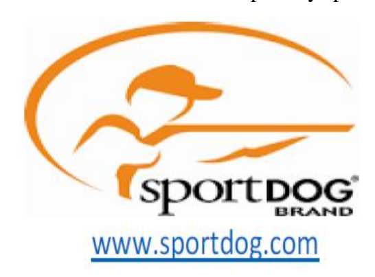
The Ontario NSDTR Club is proudly sponsored by

A draw for a sponsor donated sportDOG Brand trainer's package will be held for all qualifying dogs, two lucky teams will win. All Draws will be held at lunch break day of test.