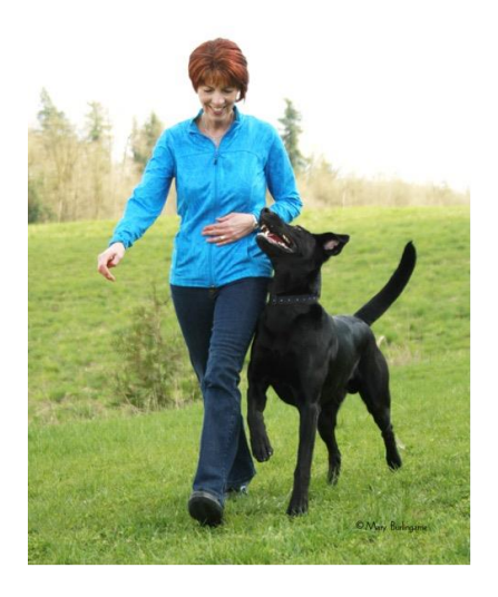
APRIL 29 & 30<sup>th</sup>, 2017